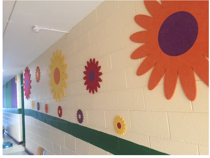
New, colourful pin boards on the 3rd and 4th class corridor—giving lots of attractive display areas for pupils' work