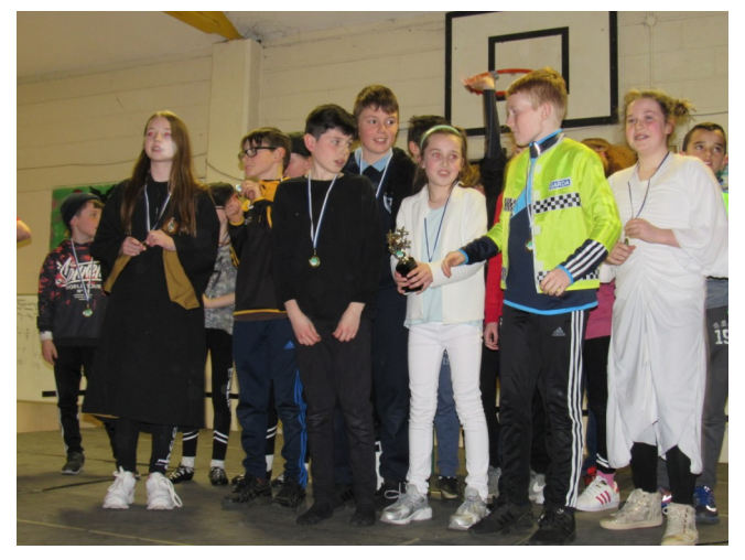
This years Talent Show winners. 5th class from R 21. They scripted, directed and produced their own TV Game Show. It was super.